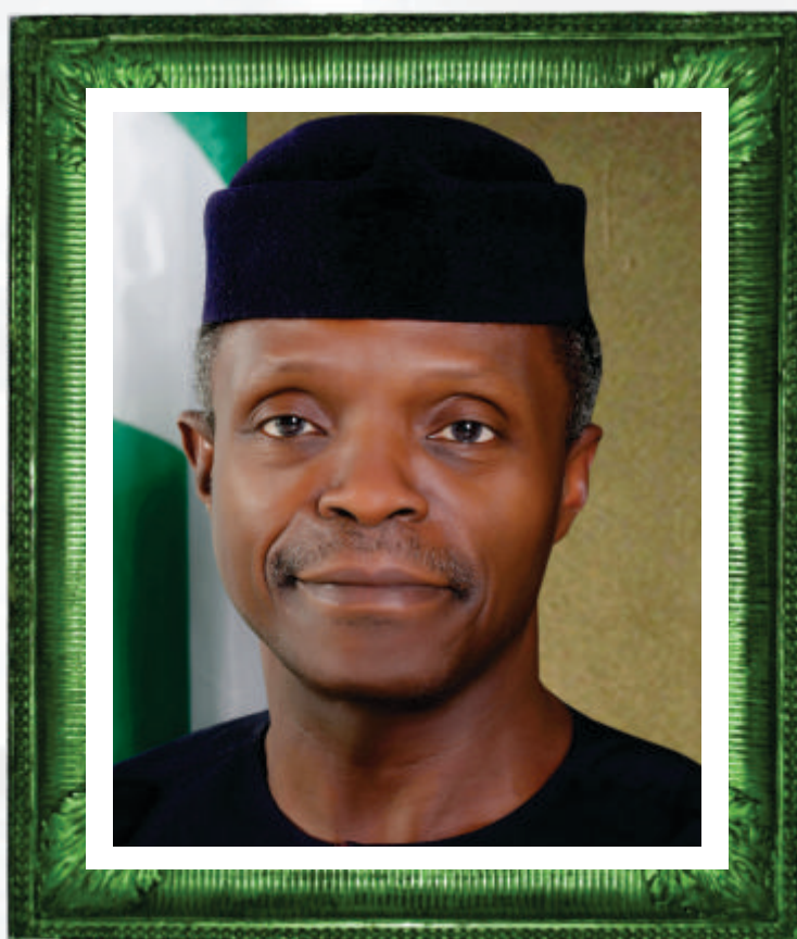
PROF. YEMI OSINBAJO, GCON

Vice-President, Federal Republic of Nigeria